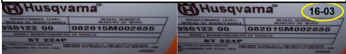
Serial Plate Before

6. Using a permanent marker, write "16-03" in the upper right corner of the serial plate to indicate service is complete.